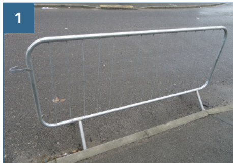
1 Place first barrier at starting point of intended line of installation.