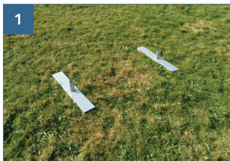
1 When you reach the desired location of the crossing point, measure the required distance and place two single metal feet in position.