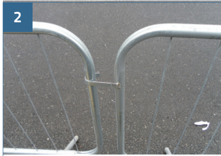
2 Connect the next barrier using the attached hook and pull tight.