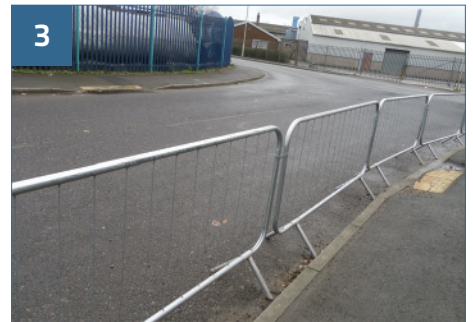
3 Repeat until installation line is complete.