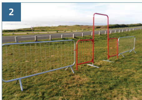
2 Insert the crossing point and attach hook to the barrier and continue with installation.