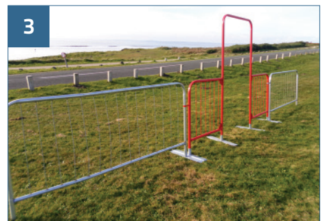
3 Crossing points can be used with any of the barriers in this guide.