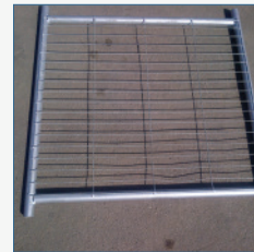
Side And Rear Panels