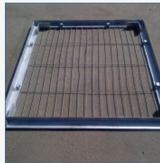
Base And Top Panels