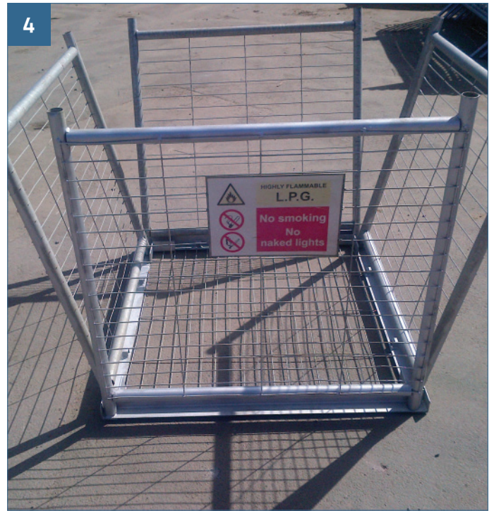
Place the Door panel in the front position and allow it to rest in the base.