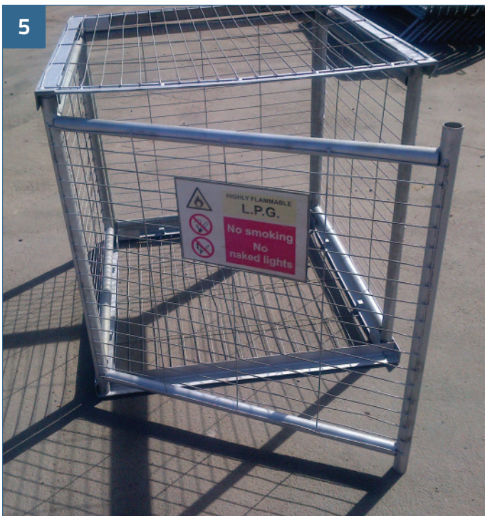
Place Top panel in position and adjust sides to fit securely into channels. Ensure the door panel opens and closes.