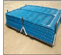
POLMIL® Panel 3m High x 2.5m