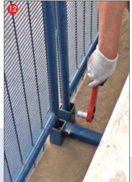
Tighten M10 captured bolt securely against Panel leg to prevent lifting. (Recommended Torque: 22N m, 16.2ft lb)