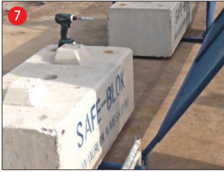
Insert Panels into Base. Manual lifting Note: Each Panel weighs 98kgs.