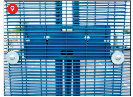
Attach Cover Mesh over Clamp Plate and Panel gap using M8x50 Coach Bolts with M12x50 washers (attack side), M8 Full Nuts and M8x50 washers (inside).