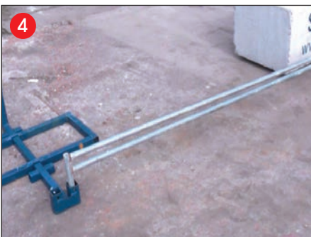
Repeat 1 and 2 using the Spacing Tool to ensure correct distance.