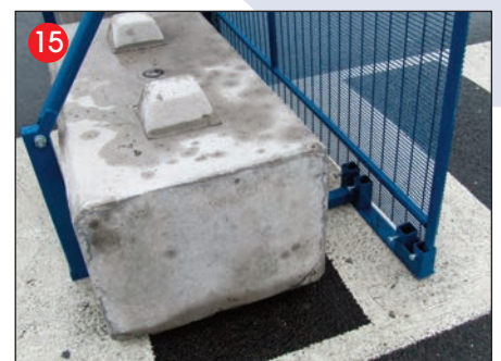
Start/Stop Bracket option for end of line.