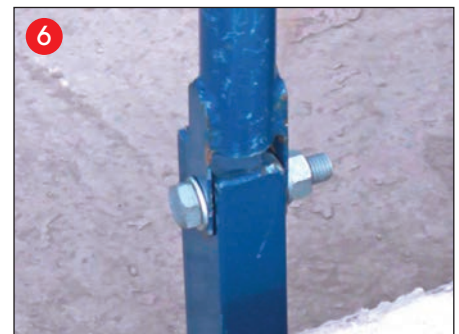
Connect Brace to Base using M16 Hex Bolt and Washers.