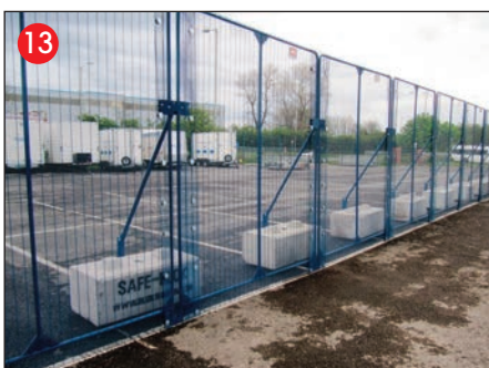
Repeat until Fence line is complete.