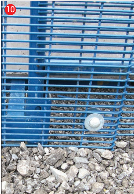
Bottom Cover Mesh bolt to be no more than 50mm from ground.