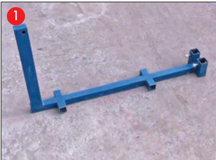
Position Base on Ground.