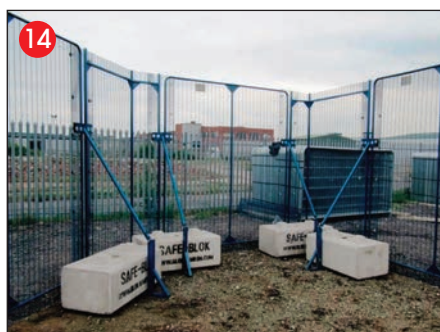
90 degree and 135 degree Corner Panels.