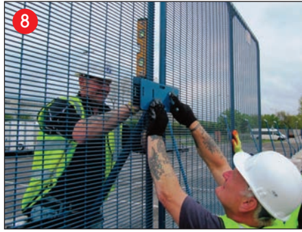
While assistants hold panels vertical, fit 4no. M8x70 Coach Bolts through Front Clamp Plate, Panel Mesh and Brace Plate using Nyloc Nuts and M8x50 Washers behind.