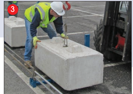
Place Ballast Block onto Base and Loading Tray (Not more than 50mm from backstop).