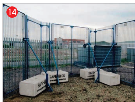
90 degree and 135 degree Corner Panels.